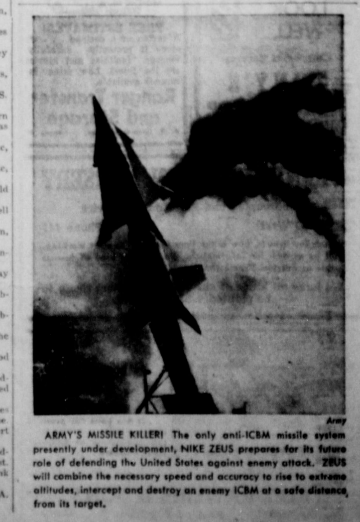
ARMY'S MISSILE KILLER! The only anti-ICBM missile system presently under development, NIKE ZEUS prepares for its future role of defending the United States against enemy attack.

Two hundred and eight East Texas State College Students have been named to the Dean's List in recognition of high grades made for the fall semester.