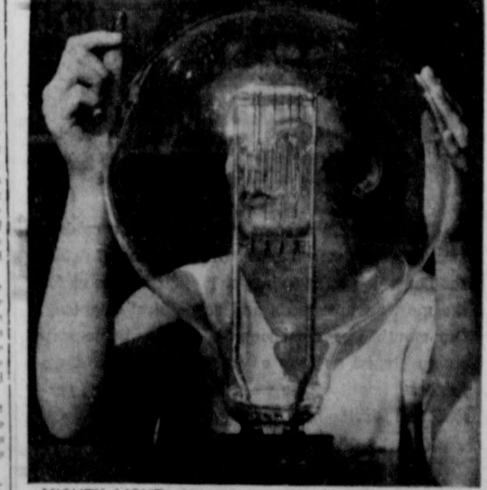
MIGHTY LIGHT—Although in size and weight it's only a fraction of the big bulb, the tiny flashbulb held by the girl gives more light. The jelly-bell-sized bulb produces 400,000 peak lumens compared to 325,000 for the king-sized 10 kilowatt light bulb.

For 331 students of Rising Star schools vacation was over and another school year had begun this week. That was the total number registered by Monday, Aug. 31, when the "books took" again and the High and Elementary schools swung into full schedule of classes. The number is about on par with the enrollment level of the past few years. One hundred and eight students registered in the High School and 223 at the Elementary School. —The Rising Star Record.