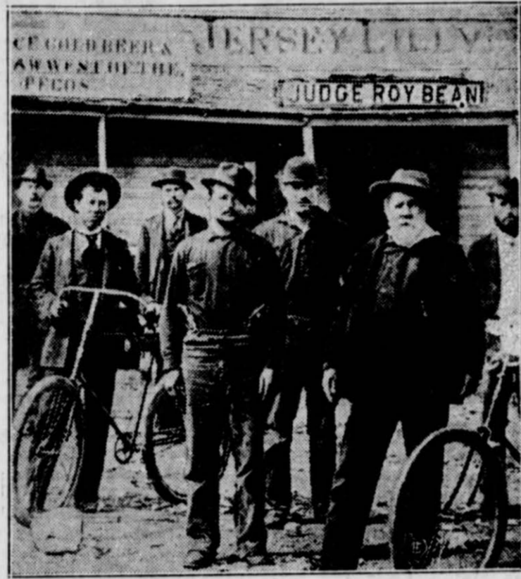
Here is a true and authentic photograph of Judge Roy Bean, "The Law West of the Pecos," pictured with some of the boys who used to whoop it up with him at the Jersey Lilly saloon in Langtry, Texas. Old Judge Bean in years gone by meted out justice in no uncertain terms. Finding a Chinaman shot to death, a gun on his hip, $30 in his pockets, Bean fined the dead man $30 for carrying concealed weapons and confiscated the pistol. The town and the saloon were named after the famous Broadway dancer of old times, Lilly Langtry, who once passed through there on the train and made a big hit with the Judge. In the picture, Judge Bean is the man with whiskers at the right.