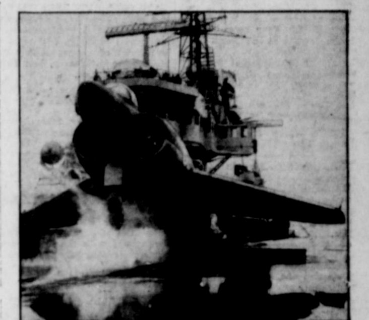
COOKIN' WITH STEAM—Vapor seeps from launching slot of a steam-propelled catapult as a Vickers Supermarine N-113 twin jet warms up aboard Britain's atom-age carrier, HMS Ark Royal.