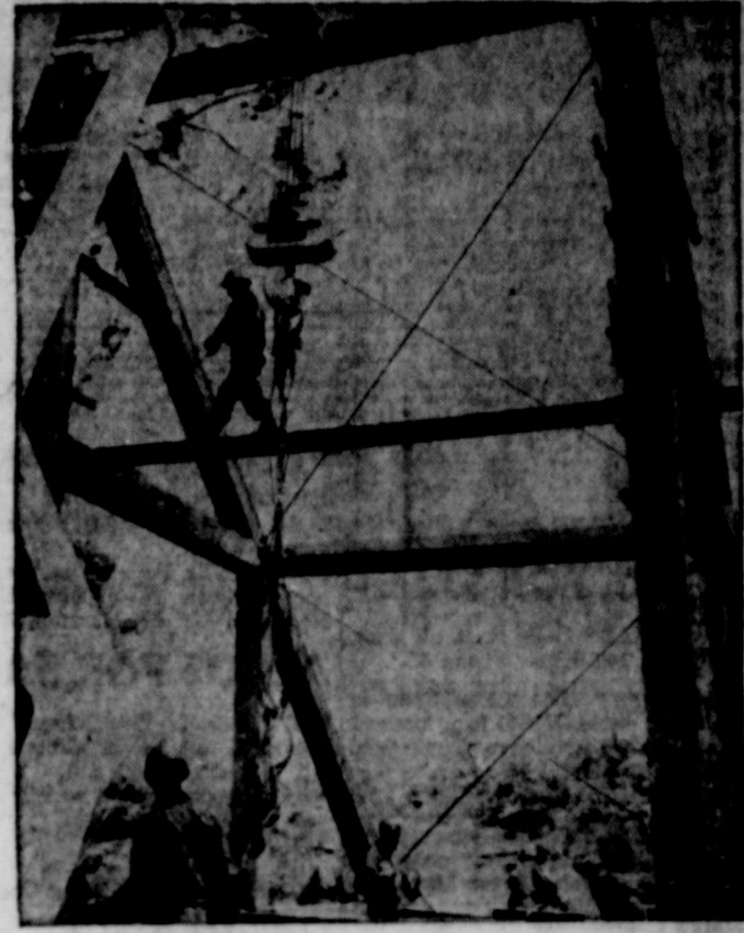
ARMY BUILDERS AT WORK—Where go the Army Engineers, a bridge is sure to follow. Here construction engineers of the Hawaii Army Reserve and the 65th Engineer Battalion build a 60-ton bridge—and a pattern for the Army photographer—on the East Range at Schofield Barracks, Hawaiian Islands.