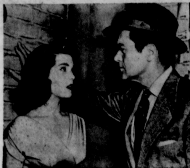
Teenagers Prowl The Nights on Your Tower Screen Frank Lovejoy and Karen Sharpe in a scene from the picture "Mad At The World" a story of trigger-happy teenagers... living for thrills and kicks. Playing Sunday, Monday and Tuesday at your Tower Theatre.