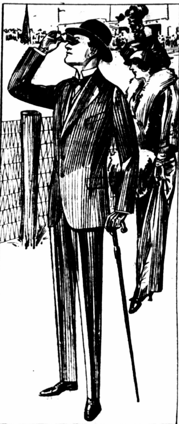
SCHLOSS BALTIMORE CLOTHES

We have complete indexes to all real estate in Roosevelt and Curry counties. Abstracts made promptly. Office, upstairs in Reese building, telephone 63.