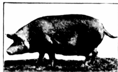
A Tamworth Sow.

Spring-farrowed pigs we do not keep, as a rule, longer than eight