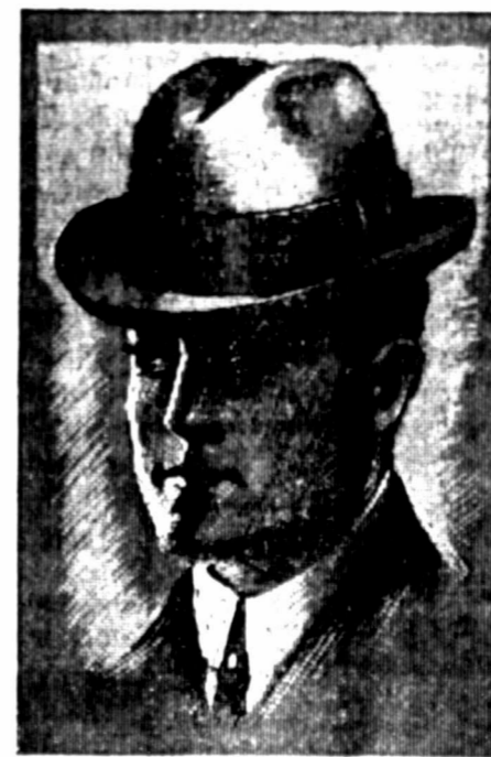
BEAVER BRAND HATS in correct shapes and colors.

Heavy cotton Shirts, a dandy garment at 50c, price ..... 39c We also have a line of boys Shirts in same quality, at ..... 38c