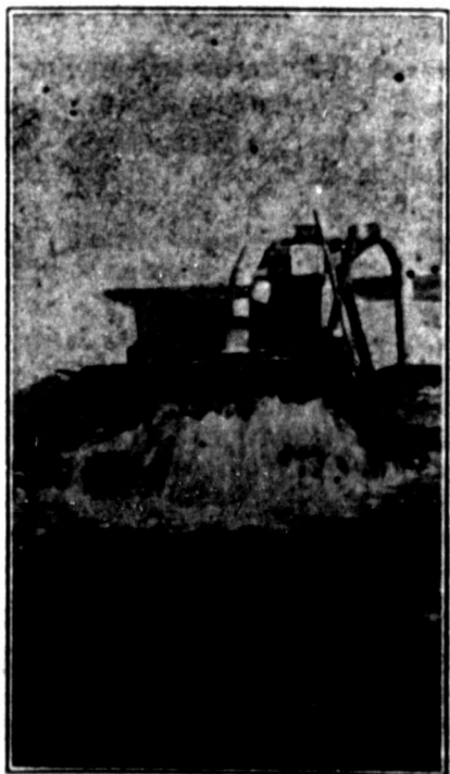
Irrigation Has Come! It includes 10,000 Acres and Costs $350,000.00