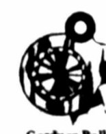
Gardner Ball Bearing Type-bar Joint.

All these kinds of work—and others—done by one simple typewriter, our regular correspondence machine, without any extra cost in attachments.