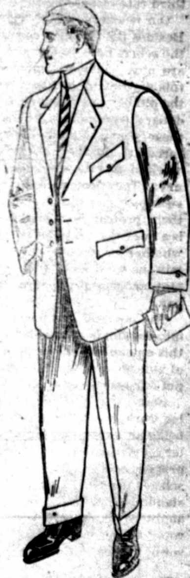
DESIGNED BY SPERO, MICHAEL & SON NEW YORK

Saturday May 15th, all day we will sell any of our $15.00, $17.50 and $18.00 men's Suits, a $5.00 pair of Shoes or Slippers, a $1.25 Shirt and a 50c Necktie for only $16.75