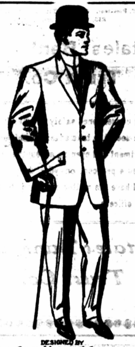
DESIGNED BY SPERO, MICHAEL & SON NEW YORK

This store is the home of the celebrated Hart Schaffner & Marx Clothing. We are showing some beautiful patterns in the spring and summer line. They will have to be seen to be appreciated. We cordially invite you to call and see the handsome, well fitting suits that are now on display. They are guaranteed to be all wool, prices from $18.00 to $30.00.