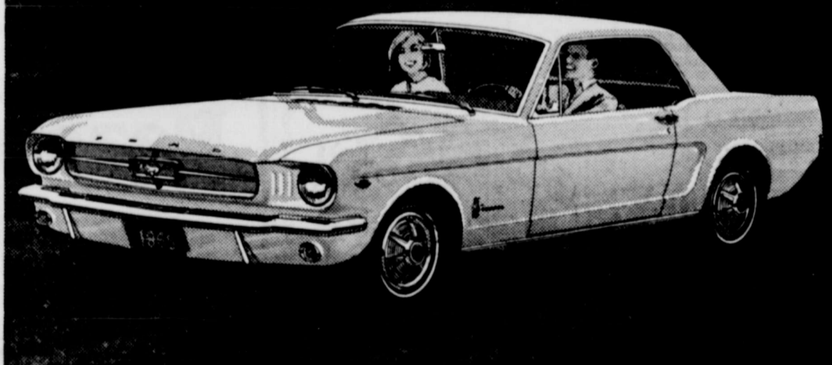
1965 MUSTANG HARDTOP

The big wait for the hottest-selling car in America is over. We Texas Ford Dealers have Mustangs—new 200-cu. in. Sixes and V-8's in stock now. Take delivery today. Go hotline!