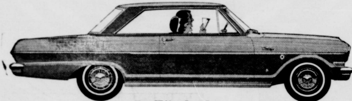
Chevy II Nova Sport Coupe