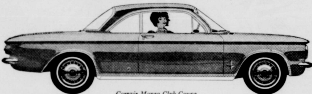
Corvair Monza Club Coupe

America's best sellers... Your best buys! Now at your Chevrolet Dealer's