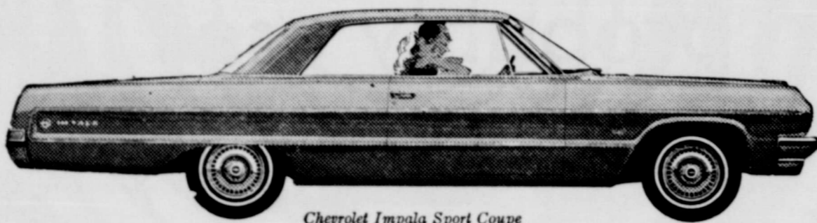
Chevrolet Impala Sport Coupe

Section 3. The Governor of Texas shall issue the necessary proclamation for the election and this amendment shall be published in the manner and for the length of time as required by the Constitution and laws of this State.