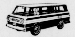
Corvair Greenbrier De Luxe Sports Wagon. Over 175 cubic feet for cargo.