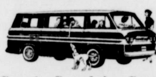
Corvair Greenbrier Sports Wagon. Sure-footed traction and easy to load.