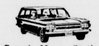
Corvair Monza Station Wagon. Monza elegance in a nimble hauler.