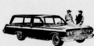
Impala 9-Passenger Station Wagon. Most elegant Chevrolet wagon.

Call Us for Prompt Efficient Service Your Business Appreciated