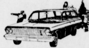
Biscayne 6-Passenger Station Wagon. Lowest priced Jet-smooth wagon.