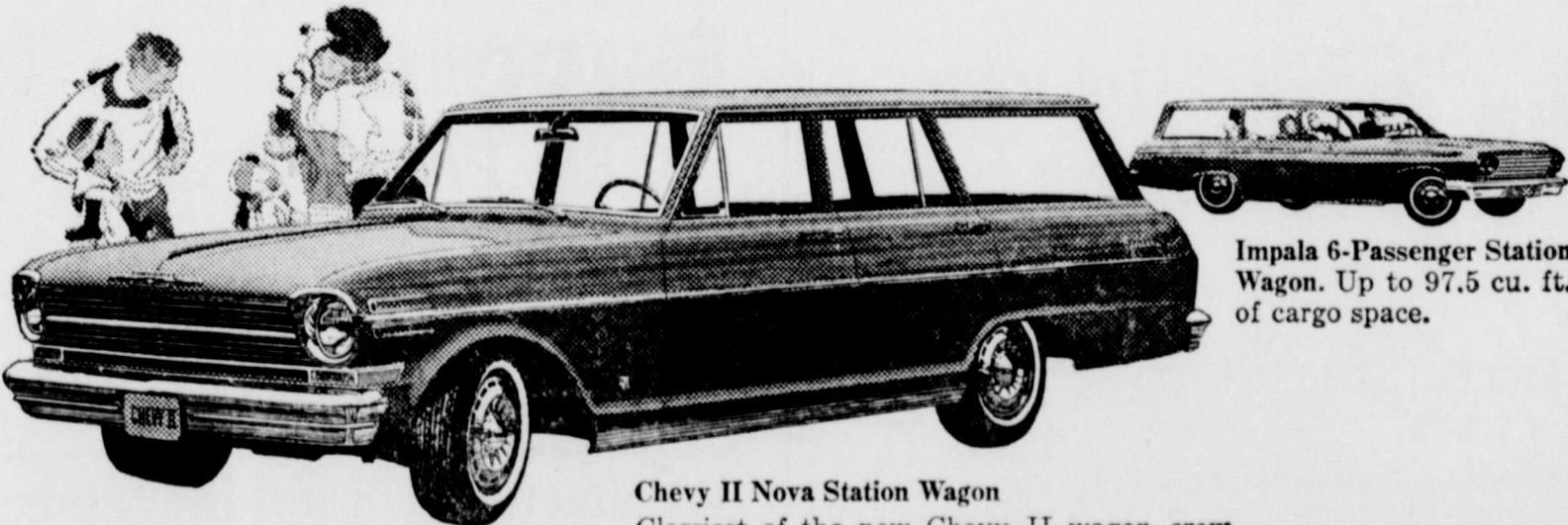
Impala 6-Passenger Station Wagon. Up to 97.5 cu. ft. of cargo space.

... in a beautiful variety of styles, sizes and prices