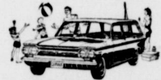
Corvair 700 Station Wagon. Extra load space in that trunk up front.