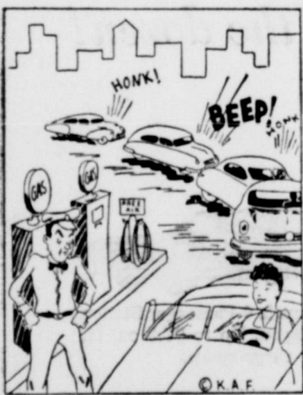
"Air, windshield cleaned, water and please dust my car out."