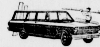
Chevy II 100 Station Wagon. Lowest priced wagon in Chevrolet's lineup.

Want a wagon? Chevrolet's got a dozen dandies. Five Jet-smooth king-sized jobs, for instance. Three frisky Chevy II wagons—with lots of luxury, load space and a low, low price. Plus four rear engine Corvair wagons like no other in the land. Find the one for you in this versatile variety at your Chevrolet dealer's.