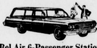
Bel Air 6-Passenger Station Wagon. Roomy hauler with a rich appearance.

Want a wagon? Chevrolet's got a dozen dandies. Five Jet-smooth king-sized jobs, for instance. Three frisky Chevy II wagons—with lots of luxury, load space and a low, low price. Plus four rear engine Corvair wagons like no other in the land. Find the one for you in this versatile variety at your Chevrolet dealer's.