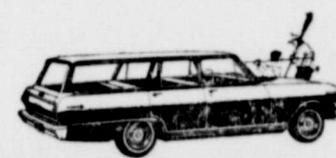
Chevy II 300 3-Seat Station Wagon. Lowest priced U.S. 3-seat station wagon.