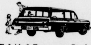
Bel Air 9-Passenger Station Wagon. Has an almost 5-ft.-wide cargo opening.