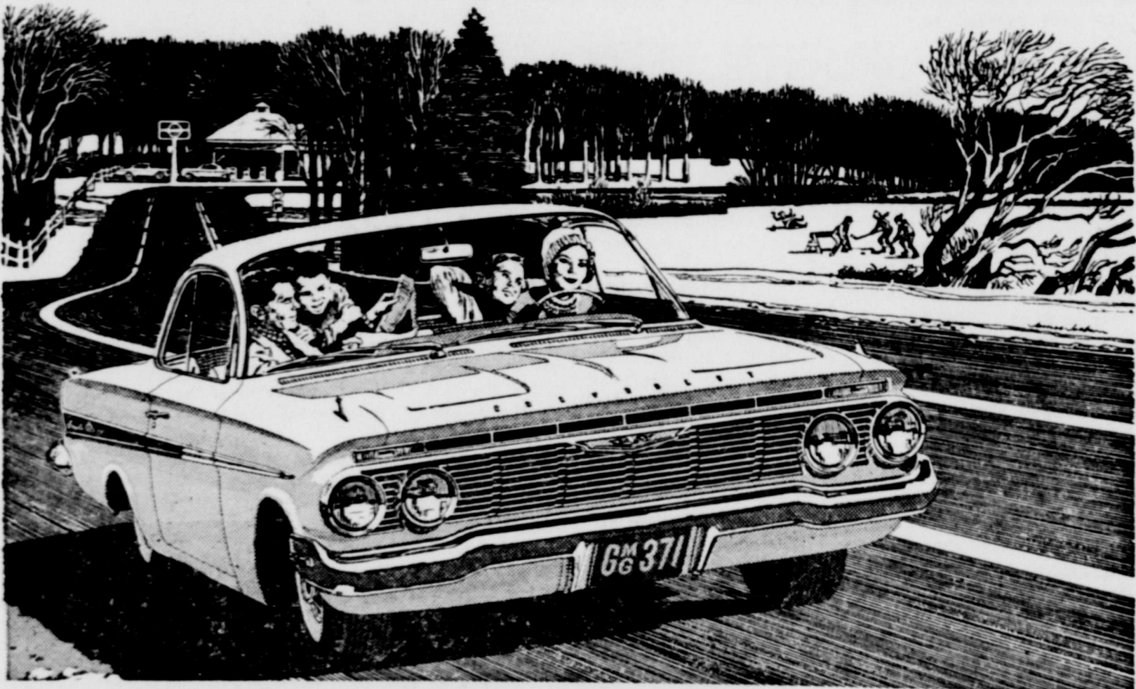
This is the Impala Sport Coupe—just one of 20 Jet-smooth Chevies!