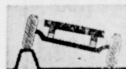
I-beam type front axle. A stiff-beam design that transmits road shock right through the truck.

Because they ride easier they last longer, too. They take better care of payloads and they make a long day's work a lot more pleasant for the driver. All that—primarily because of Independent Front Suspension (I.F.S.). If you think it's stretching a point to attribute that many advantages to a suspension system, you haven't driven a new Chevy with I.F.S. Take the wheel and feel its road-leveling ride, its almost total absence of shimmy and wheel fight, its ease of steering even in the big rigs. Spend hours behind the wheel and you're not nearly as tired. You're not and neither is the truck. That independent suspension soaks up the worst shock and vibration—the kind that can twist sheet metal and loosen joints and increase your maintenance costs. That's why Chevy trucks keep on working and saving for extra thousands of miles.