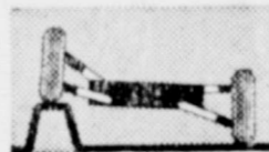
Chevy Independent Front Suspension. Wheels flex independently, minimize body wear and tear.