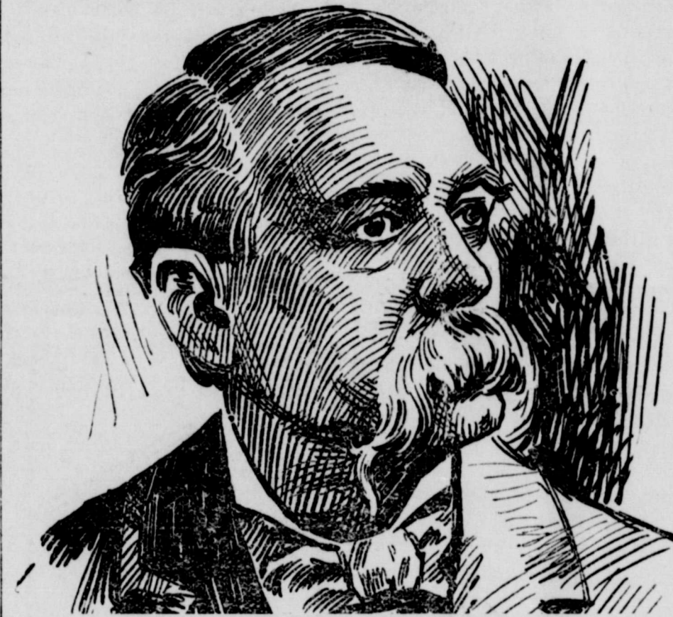
THOMAS DUNN ENGLISH.

In 1879 Dr. English took up his residence in Newark, where he was in