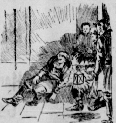
HAD FALLEN HELPLESSLY.

Where was that happiness now? The old man's thoughts flickered up