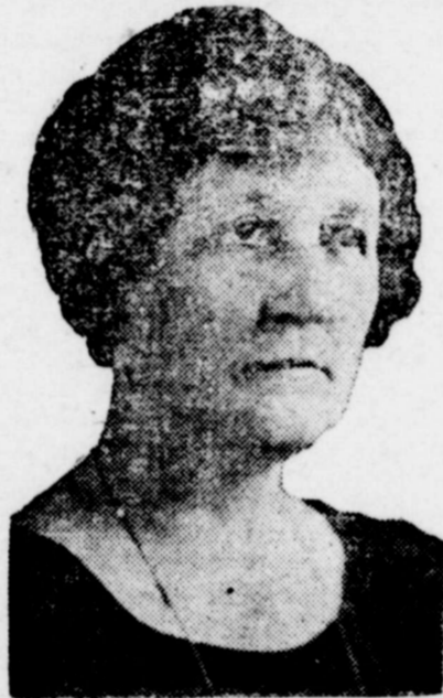
Mrs. Miriam A. Ferguson, of Temple, Texas, is opposing Felix Robertson, of Dallas, self-confessed klan candidate, for the governorship of Texas. She is a member of the Episcopal church, mother of two splendid daughters and a woman of rare common sense and executive ability. Her candidacy is endorsed and being actively supported by every one of the seven other candidates for governor eliminated in the first primary.