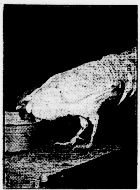
Obtaining High-Class Breeding Stock to Essier for the Small Poultryman When Sales Are Held.

The methods favored by large poultrymen for increasing the productivity of their flocks are often applicable on the general farm or in the back-yard poultry plant. Every poultry keeper will, therefore, do well to keep in touch with what the leaders are doing to increase their profits, says the United States Department of Agriculture. Certain localities in California, for instance, have become famous for their poultry and egg production, and the study that is given to these prob-