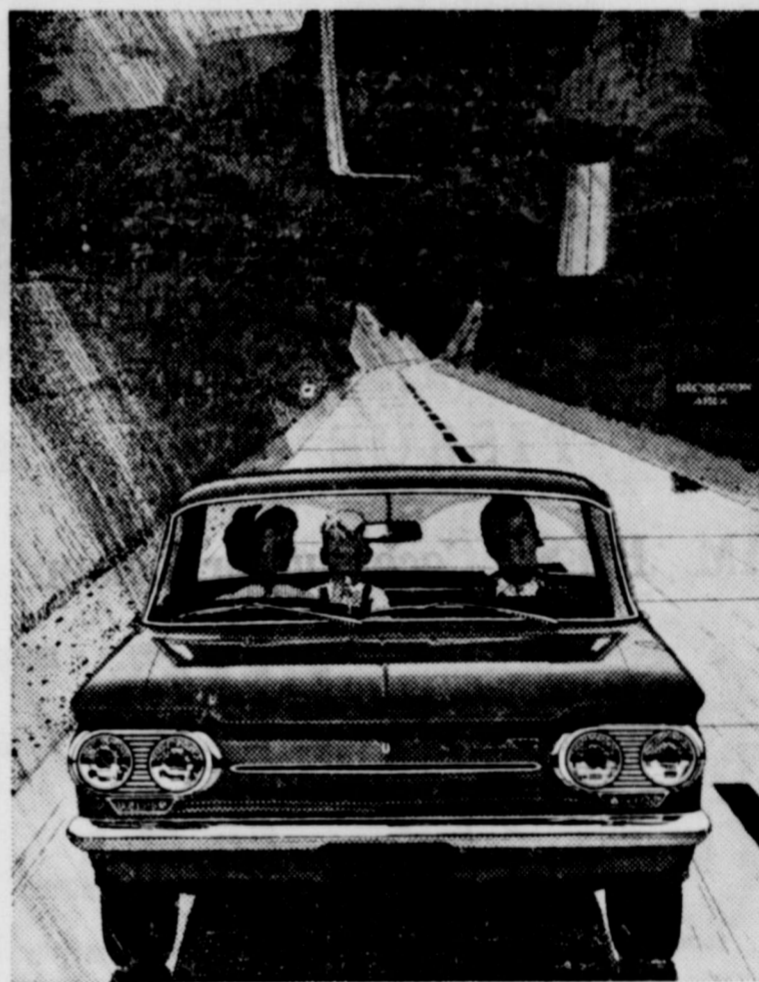
Monza Spyder Club Coupe

Come hill ... or high water Vacations go smoother in a Chevrolet Corvair