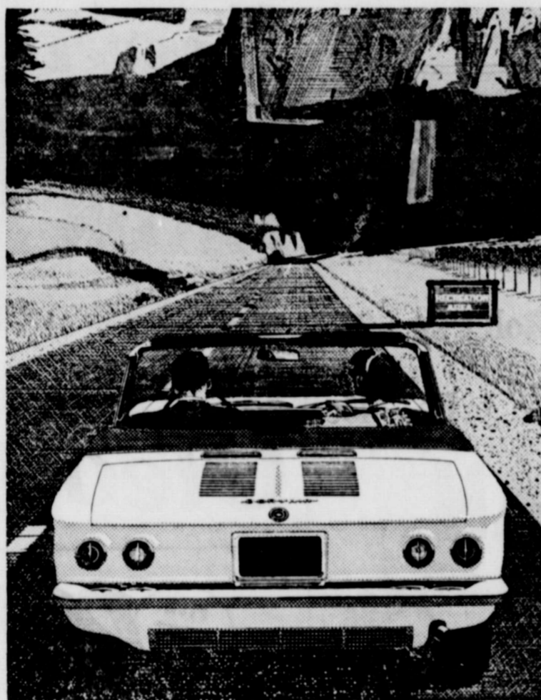
Monza Spyder Convertible