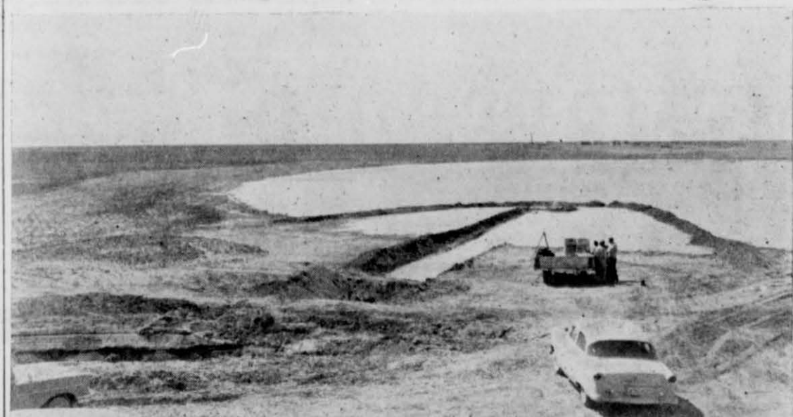
This is the lake being drained by the flocculation process on the Bill Sutton farm southeast of Dimmitt. The water enters the small lagoon where the chemical is applied. It then enters a concrete pipe at the far side of the lagoon which lies in the trench to the left of the trailer. Finally it moves into the settling basin (lower left) where suspended particles settle out.

Experiments on the Bill Sutton farm five miles southeast of Dimmitt are showing that apparently a chemical known simply as AP-30 will be satisfactory in preparing lake water for underground recharge.