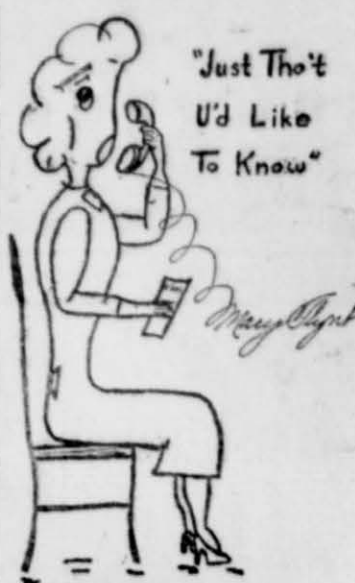
Spring is sprung, the grass is rising, it's waving on its own budget!