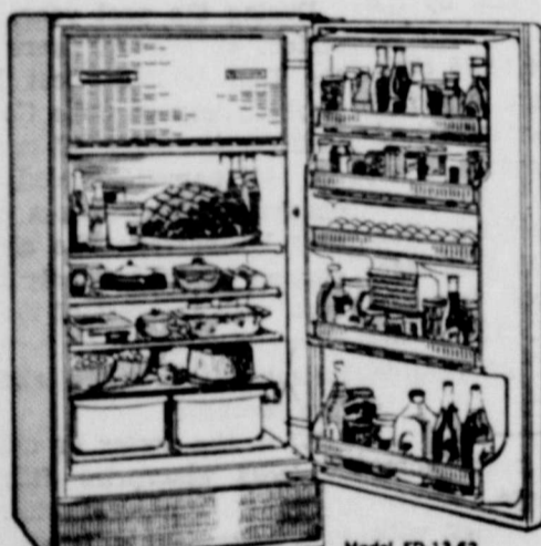
Model FD-13-62 13.14 cu. ft. net capacity

Designed by engineers but planned and proved by American women! New models. New sizes.