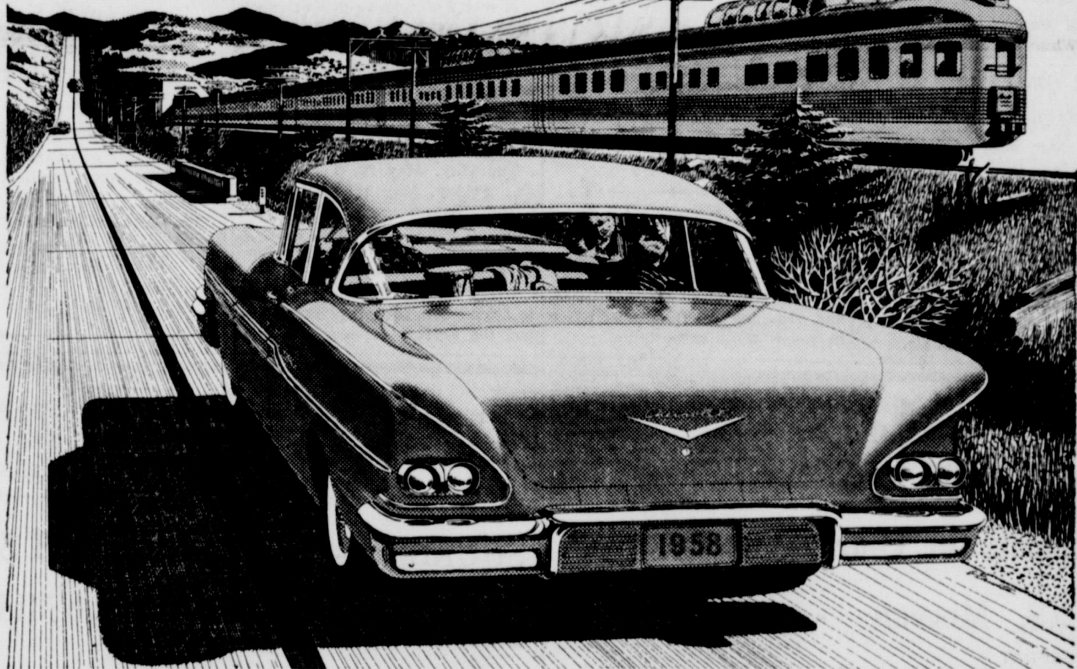
The Biscayne Two-Door Sedan with Body by Fisher. Every window of every Chevrolet is Safety Plate Glass.

Air Conditioning—temperatures made to order— for all-weather comfort. Get a demonstration!