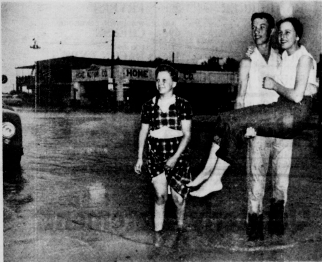
WATER BOUND —Water in Bronte had receded somewhat when the picture above was

By far the most water which has fallen in Coke County in many years, the rainfall was welcome in spite of the extensive damage. The Oak Creek Reservoir, which supplies Bronte with water, had risen four feet late Wednesday and was rising steadily as the creeks continued to feed into the lake. The rains should also give the area a good underground seasoning and ranges and crops will benefit greatly.