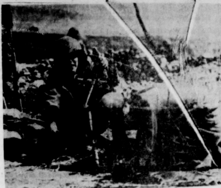
MOTARS BLAST AWAY—