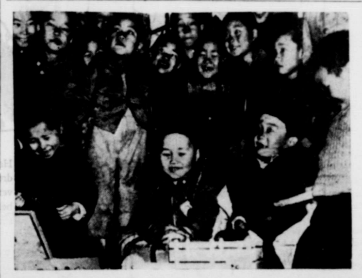
TOYS BRING JOY KOREA—Happy grins on the face of these Korean youngsters reflect the joy brought by gifts of toys and clothing from Marine Corps League in the U. S.