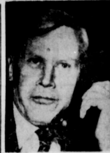
DIRECTOR OF HUSH-HUSH