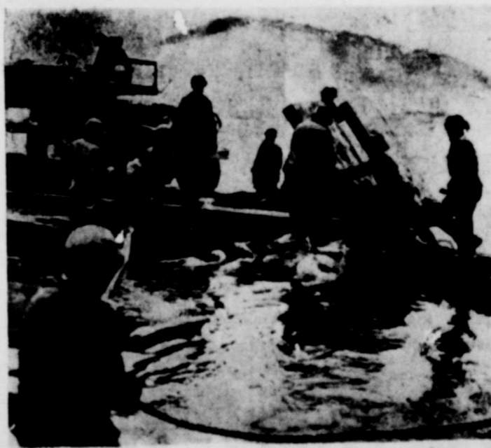
ASSAULT BOATS FERRY KOREA—Troops unload a two and one-half ton truck from combat ferry, built of boats and propelled by an outboard motor, after carrying it across the flood level waters of the Han River.