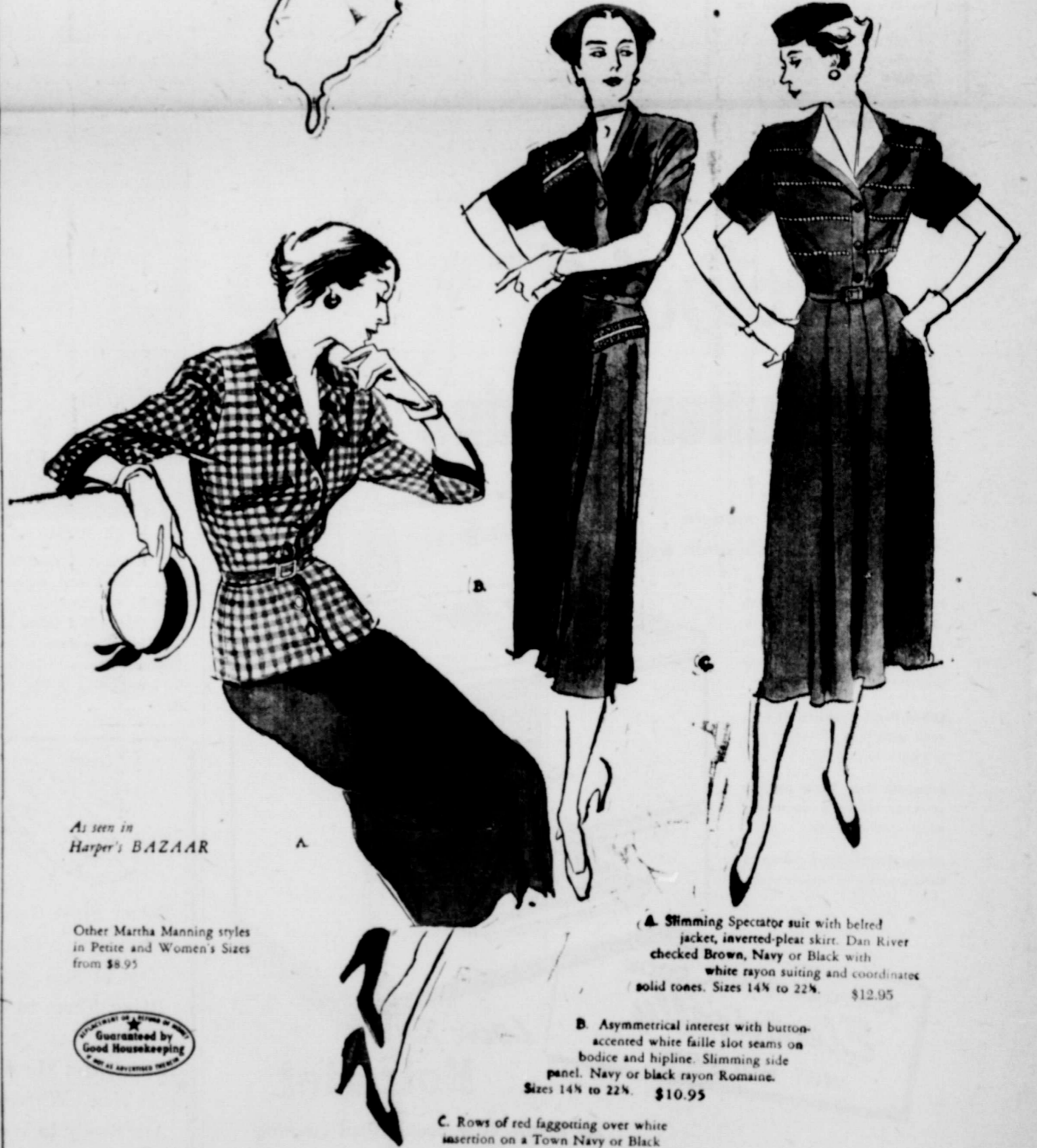
As seen in Harper's BAZAAR