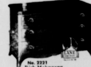
No. 2221 Rich Mahogany