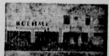
Our New Plant, Built in 1941

West Texas' Most Popular Loaf for Over 31 Years!