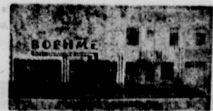
Our New Plant, Built in 1941

West Texas' Most Popular Loaf for Over 31 Years!