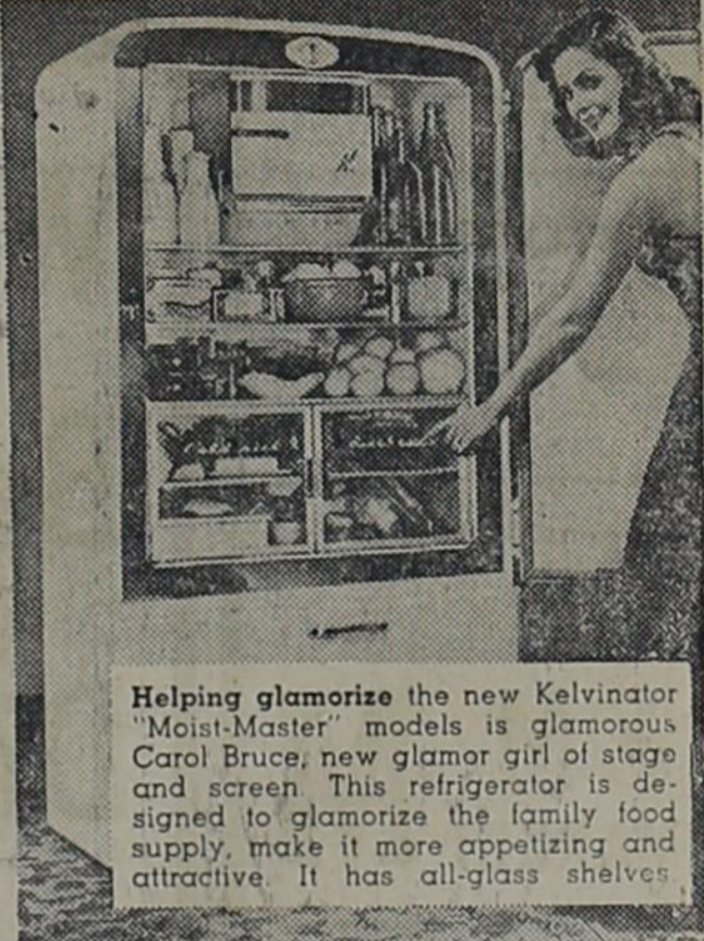
Helping glamorize the new Kelvinator "Moist-Master" models is glamorous Carol Bruce, new glamor girl of stage and screen. This refrigerator is designed to glamorize the family food supply, make it more appetizing and attractive. It has all-glass shelves.