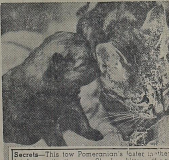
Secrets—This tow Pomeranian's foster mother lends an attentive ear. She has kittens of her own, but finds room for a puppy too.