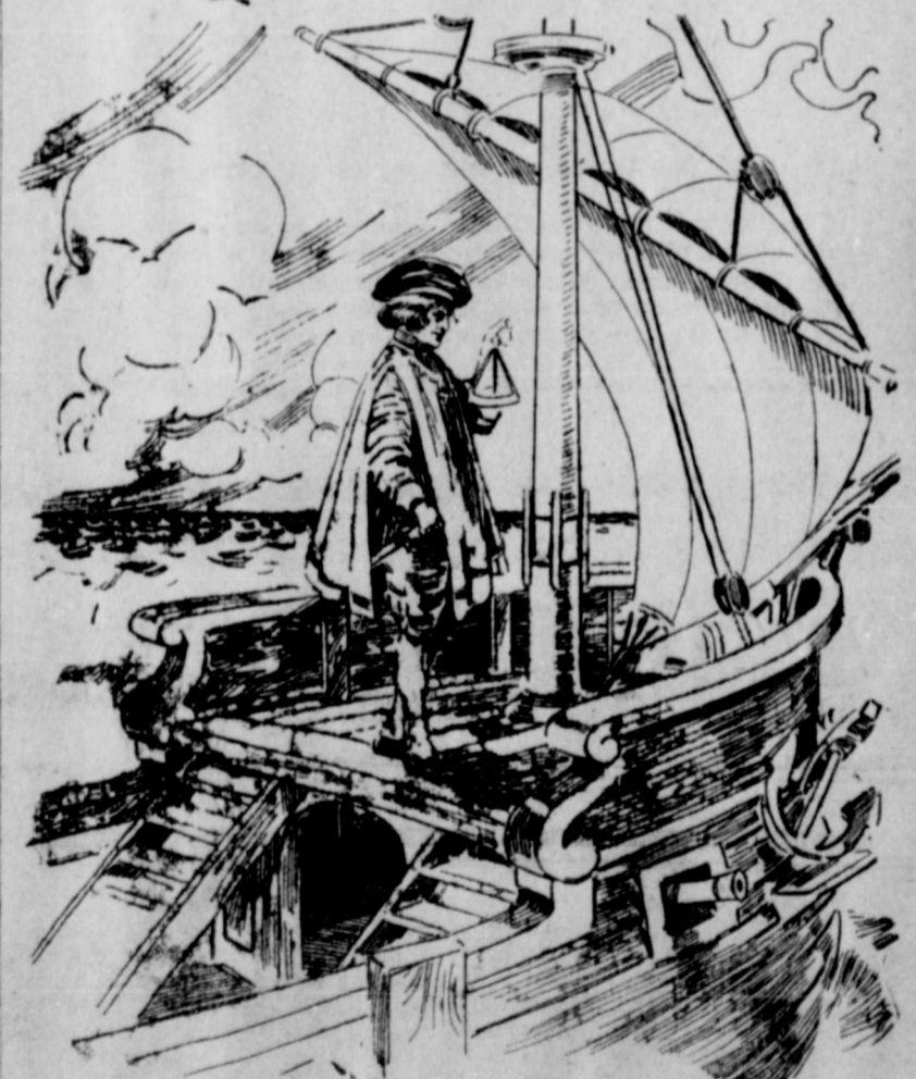
COLUMBUS DISCOVERING AMERICA.

COLUMBUS discovered America and Galileo discovered solar systems and planets and throughout all ages, civilization has been indebted to wise men who could think beyond the age in which they lived. We need in State government men who can see across two continents and look into the horizon of Twentieth Century civilization and discover new zones of trade, new worlds of industry and new planets of prosperity.