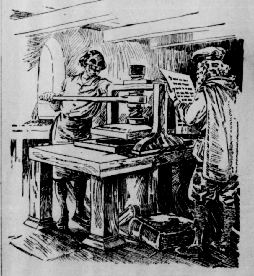
THE FIRST PRINTING PRESS.

THE Chinese made the first paper and the Germans made the first type and brought education within the reach of every citizen on the globe. These achievements, together with the printing press, were the crowning glory of civilization. The Texas press is a great industrial educator. To read our newspapers makes the farmer want to start another plow, the miner shoulder his pick, the manufacturer enlarge his plant and the banker increase his investments. Our marvelous progress is due largely to our inspired writers who sweetly sing the praises of Texas.