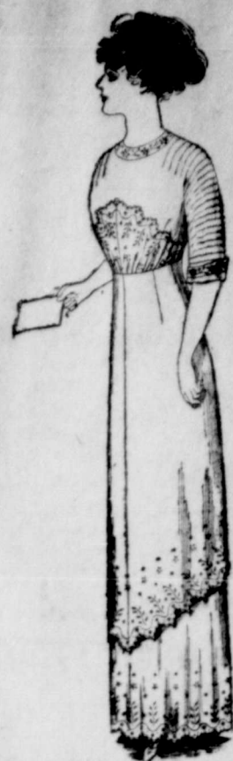
McCall Patterns No. 4157—Waist, No. 4156—Skirt Price, 15 cents each A SMART FROCK

We have just received a new shipment of McCall's Patterns and will continue to handle the same for the benefit of our customers. Call in and get a fashion sheet.