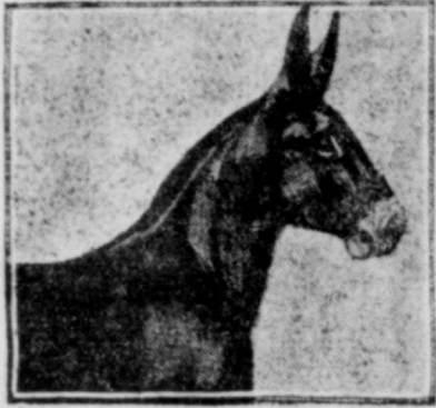
GOOD HEAD AND CARRIAGE.

Of some 350,000 mules sold annually in this country at present Missouri furnishes perhaps 70,000, Tennessee 60,000, Texas over 50,000 and Kentucky about an equal number, the sales being double the number foaled. The mules of the states in the northwest are very large of bone, body, substance and power, but have not usually the style, finish and fine sleek coats of southern mules. In the south mule