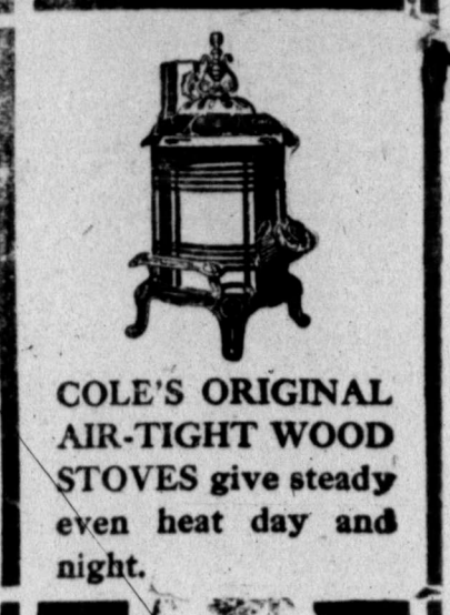
COLE'S ORIGINAL AIR-TIGHT WOOD STOVES give steady even heat day and night.

Need something in Furniture? You and your husband will be interested in our big showing of high-quality Dining Room Suites, Parlor Suites, Rockers, Etc.