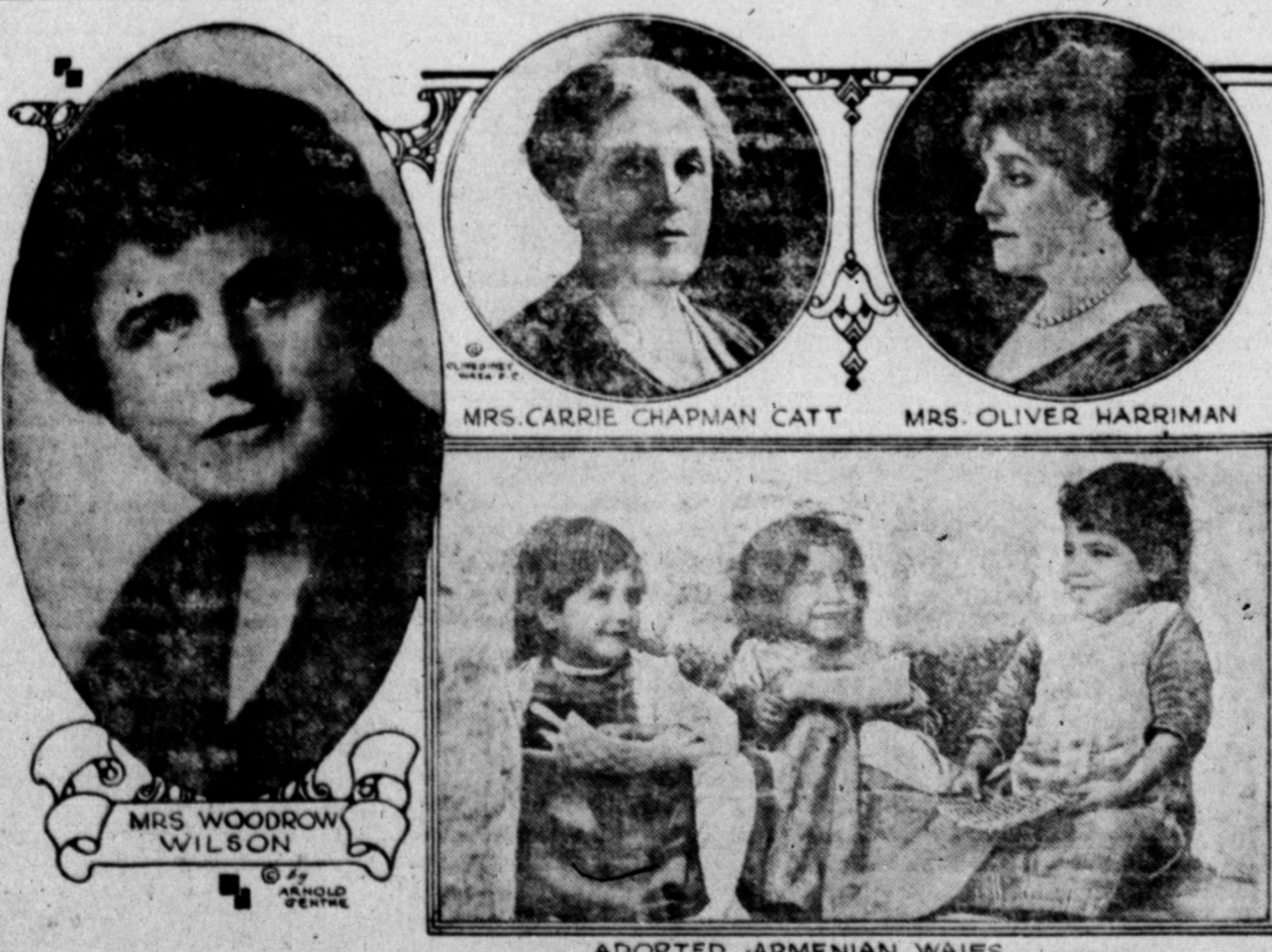
MRS. CARRIE CHAPMAN CATT