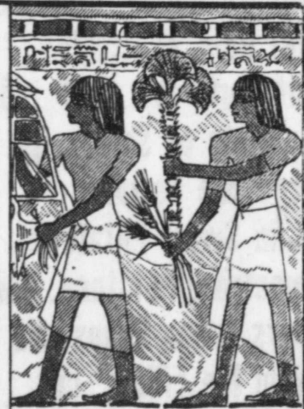
Barley is one of the oldest known grains.

barley production, followed by France, Canada, the United Kingdom, West Germany, and Turkey. North Dakota, California, Montana, Minnesota, and Washington are our top barley producing states.