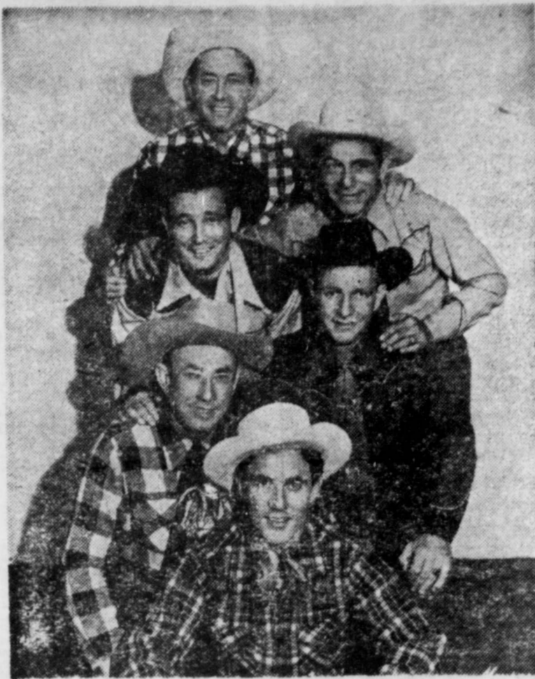
"Sons of the Pioneers" will be in Amarillo in person to appear twice a day at Tri-State Fair in an entertainment packed program at 2:30 o'clock and 8 o'clock each evening, Sept. 24 through 29.