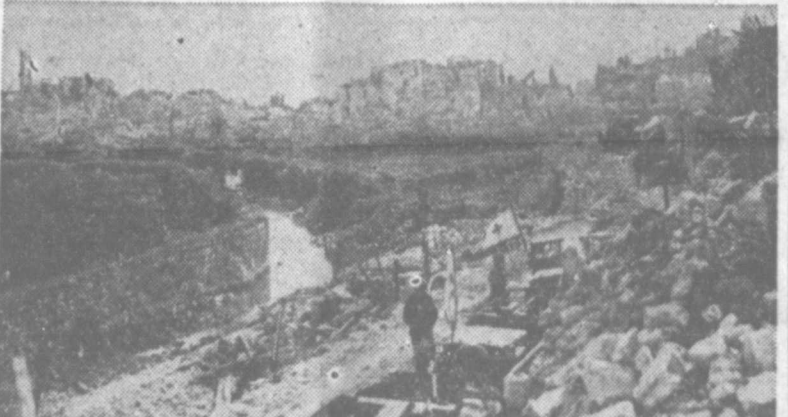
Italy—Against a background of war's ruin at Cassino, an Allied medical unit moves to the front to attend the wounded.

(EDITOR'S NOTE: When opinions are expressed in these columns, they are those of Western Newspaper Union's news analysis and not necessarily of this newspaper.)