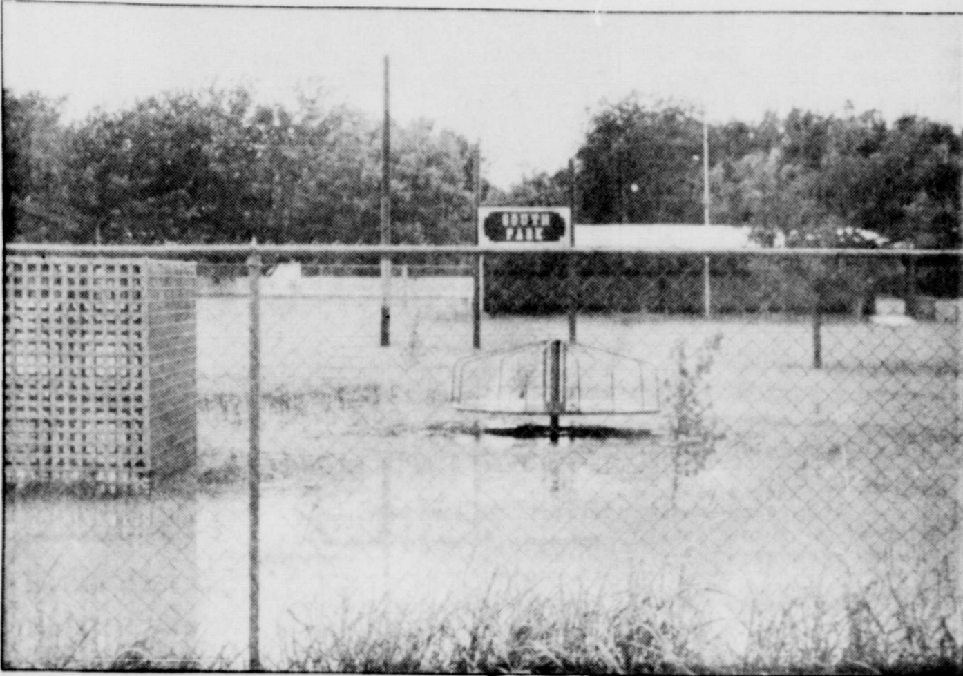
Chamber of Commerce officials hope the South Park doesn't look like this Monday as they are getting ready for the 8th annual Fun Day celebration.

FUN DAY INFORMATION...PAGE 5 OPINION ON RAISING COMMODITY PRICES...PAGE 7