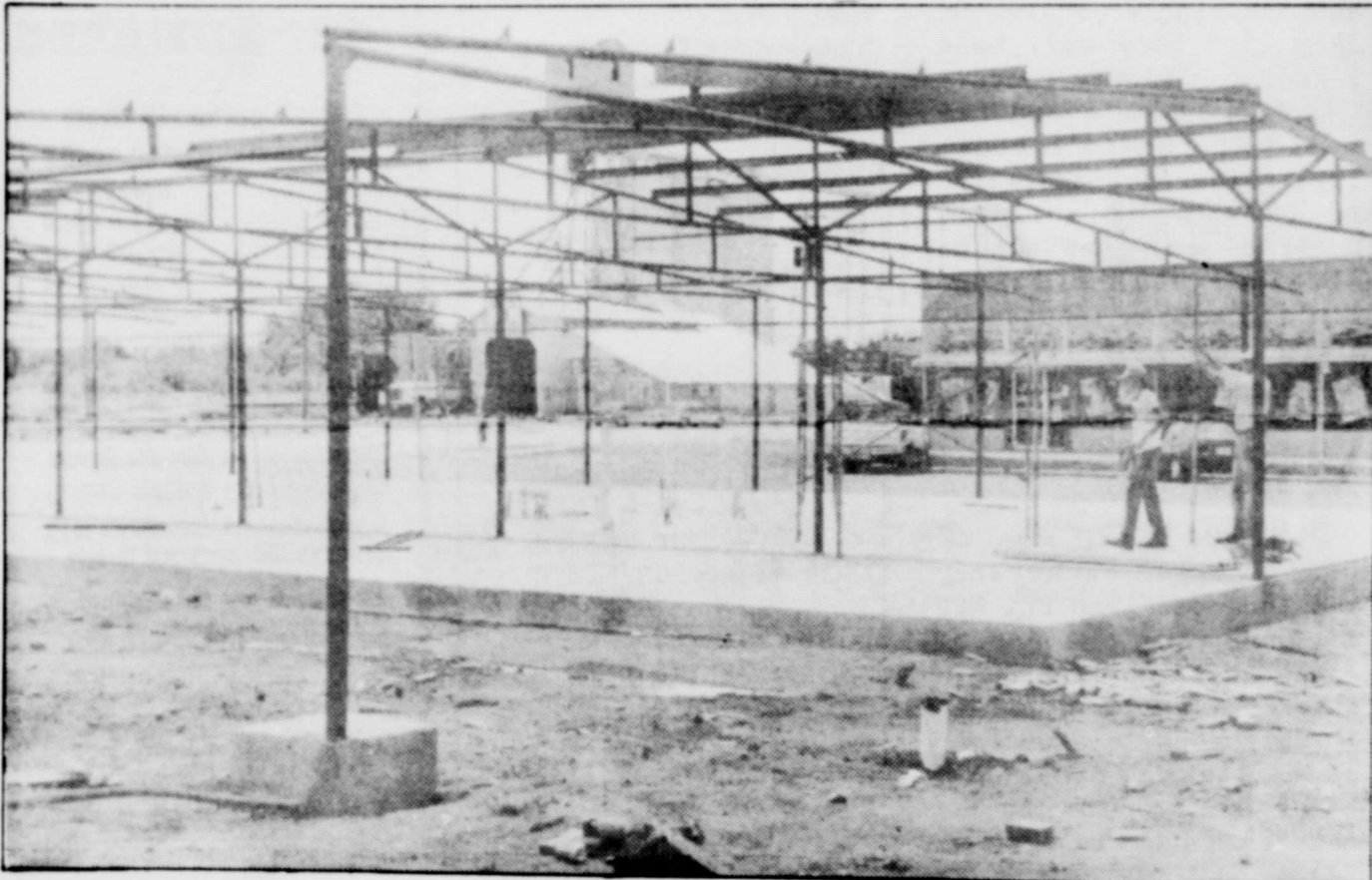
Work is moving right along on Merkel's new City Hall. Adding metal "sk-