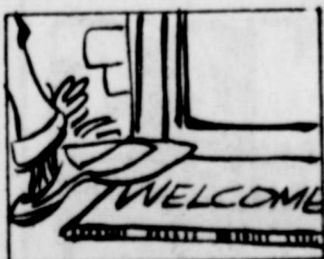
Some people say it is unlucky to enter a house or room with the left foot foremost.