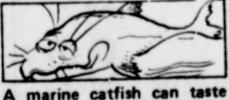
A marine catfish can taste with any part of its body