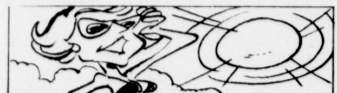
Phoenix, Arizona is the U.S. city with the largest number of days of sunshine—213.