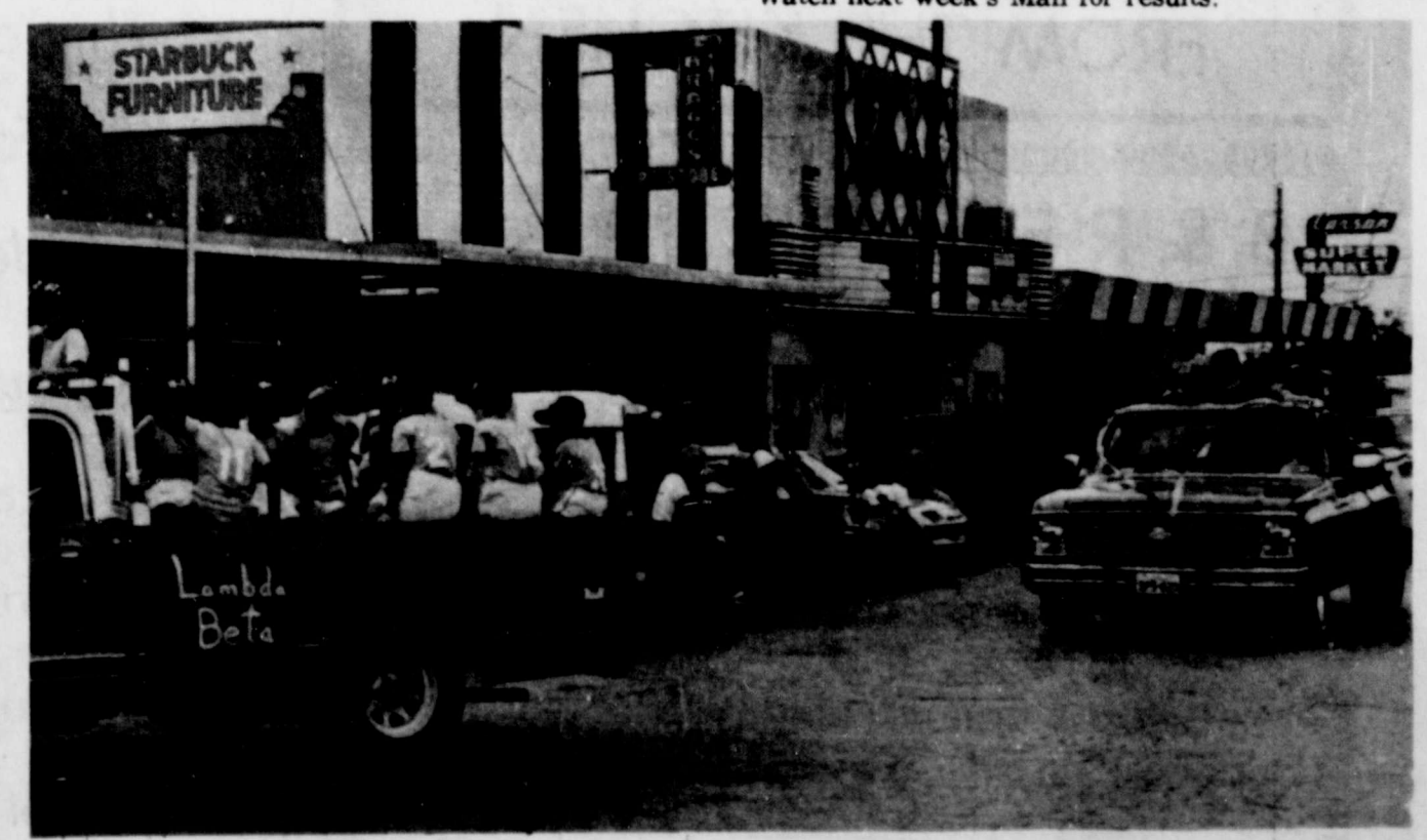
The Merkel Little League and the M-T United Girls Softball Association held their opening day

The Badgers are leaving for the regional meet in Lubbock Thursday and the field event will be held Friday with the running events on Saturday. Watch next week's Mail for results.