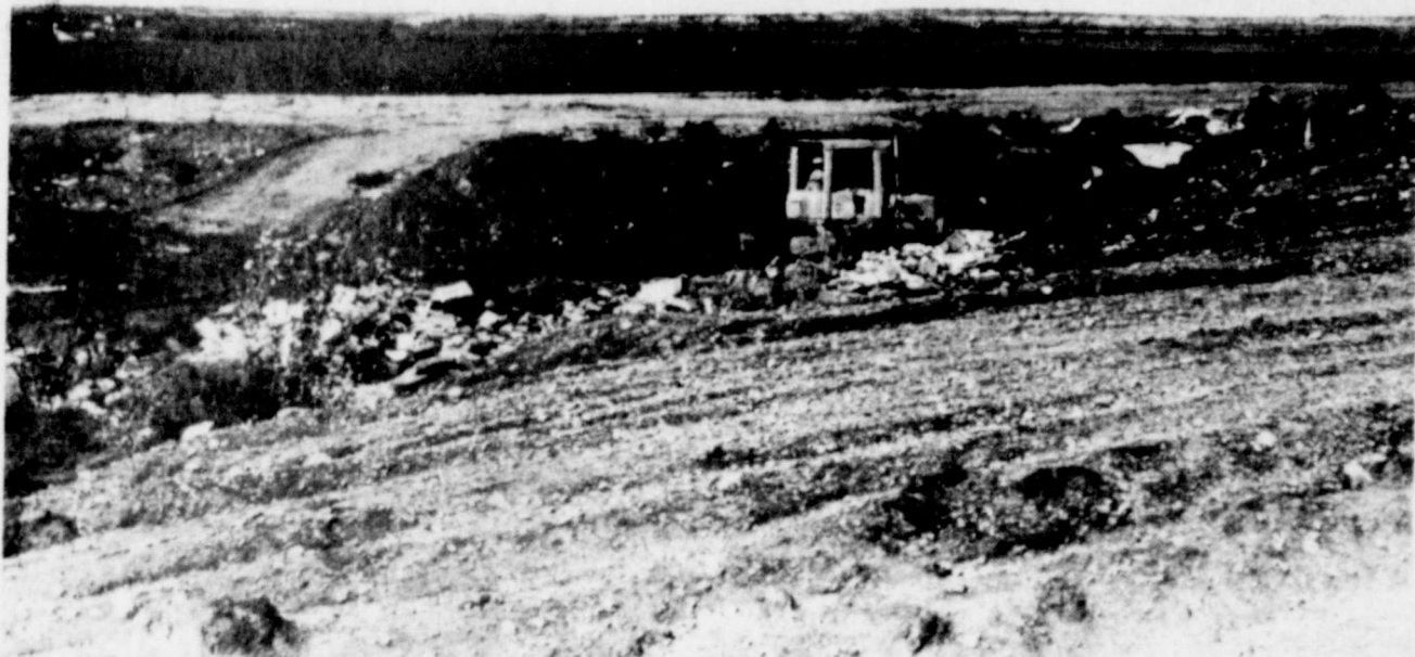
The Texas Department of Health has filed a lawsuit in 104th District Court in Abilene because

of city landfill operations. The Merkel City Attorney is currently drafting a formal response to the suit.