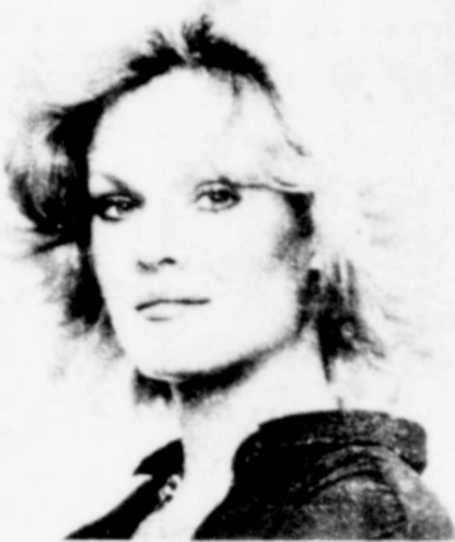
Gloria Loring plays Liz on "Days of Our Lives."