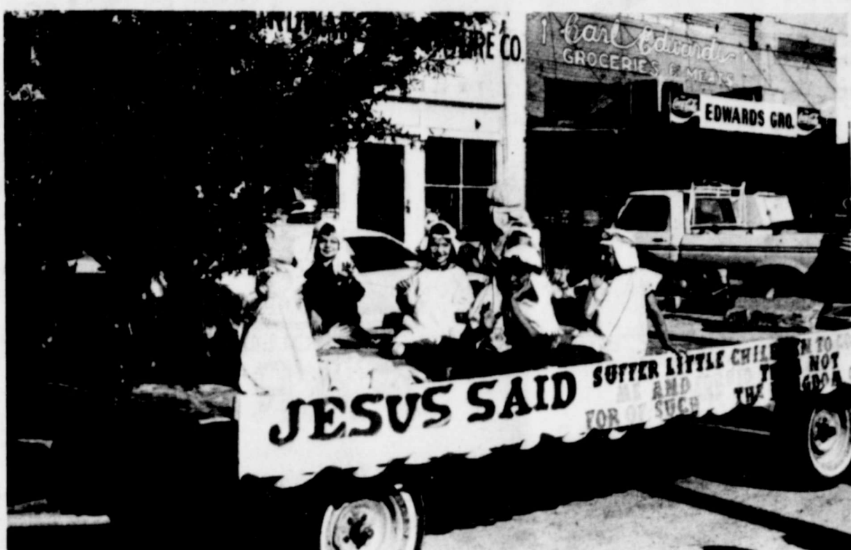
Trent's Homecoming parade two weeks ago was one of the largest they have had in years.