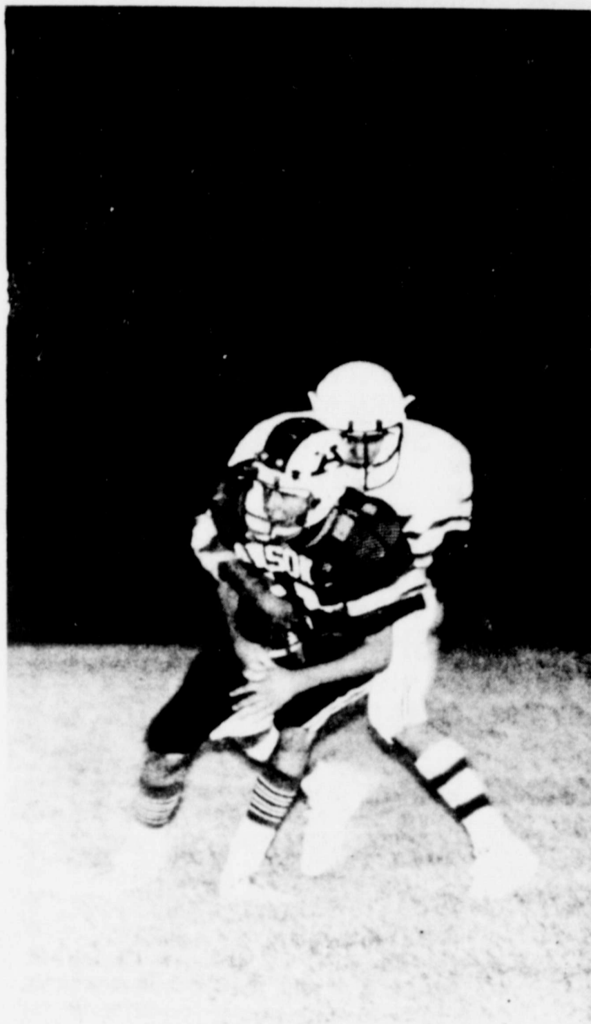
Sal Acosta wraps up the Anson quarterback in last week's 3-2 win over Anson.