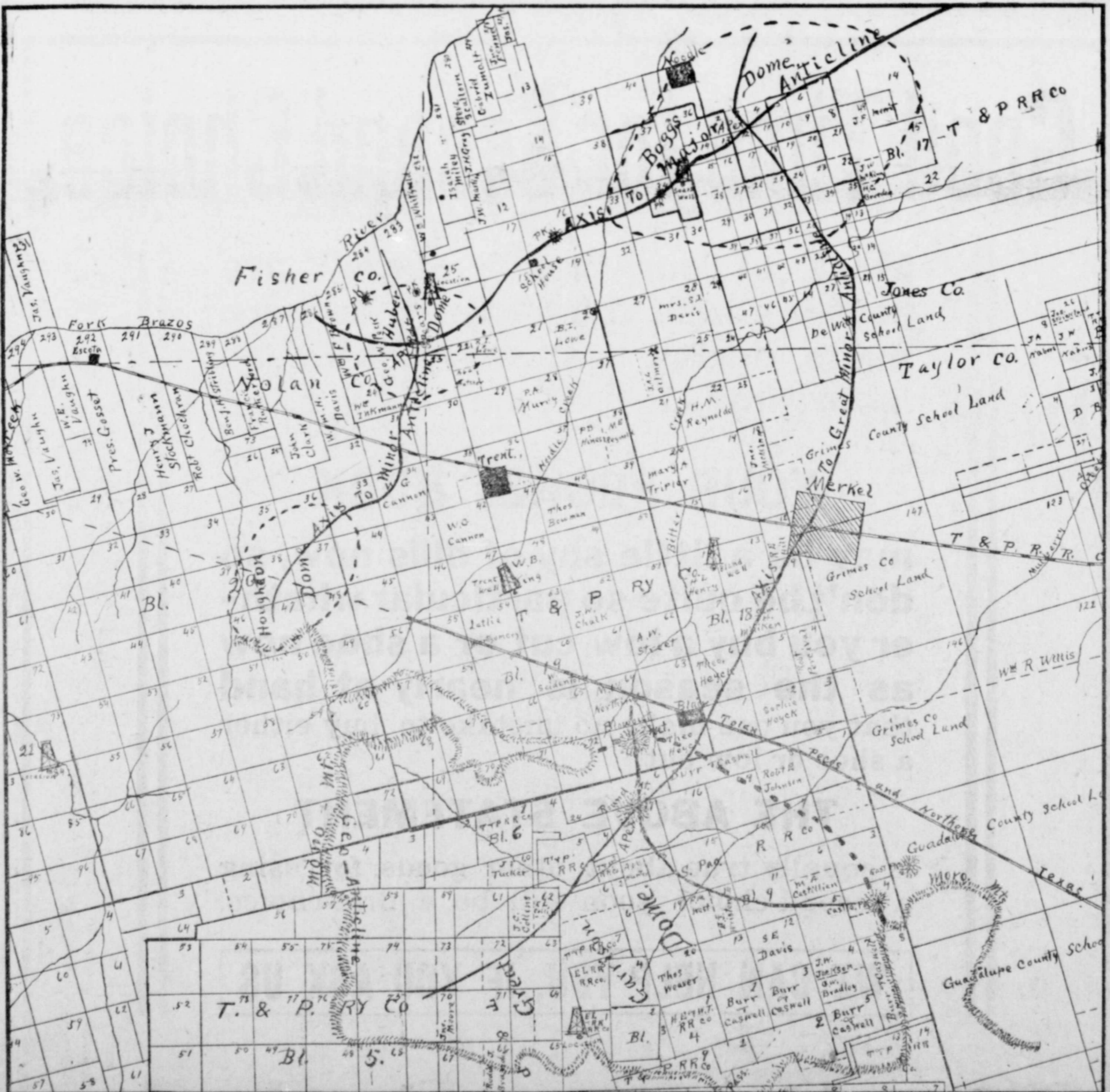
MAP OF THE MERKEL OIL FIELD

The above is a map of the Merkel Oil Field, of which, it is very likely, the world will know in a remarkably short time. The map is issued by the Board of Trade and a copy will be furnished to any address upon request. They will be issued in pamphlet form in a few days. Call in at the Merkel Mail office and get a few copies and mail to your friends. Give them a chance to become millionaires by obtaining some acreage now. Tomorrow may take from them the opportunity they so much desire. Goods reports are continually coming from the Sears well. Bland well soon in operation. Business picking up.