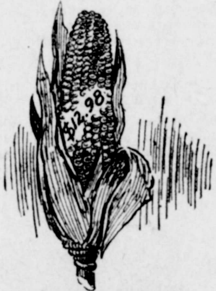
1910 VALUE PER ACRE

Texas is a world's force in agriculture. Withdraw our farm products from the market and the people of two hemispheres will go hungry and shiver with cold. Out of the soil and from the air our farmers take annually nearly a billion dollars of wealth. In plowing the land the Texas farmers walk 330,000 miles per annum, which is equal to traveling around the globe 12,200 times.