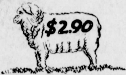
1910 VALUE PER HEAD $2.90.

The sheep is the greatest politician of all animals. He has entered every campaign since the beginning of government and in a number of elections his fleece has been the paramount issue. Sheep have been mentioned in the platform of every political party and wool has been listed in the tariff schedules of every nation on the globe. As a statesman he has pretty well held his own and although occasionally beaten at the polls and ejected from legislative halls, his friends invariably resubmit the issue, and today his fleece is protected by a tariff of 11 cents per pound.