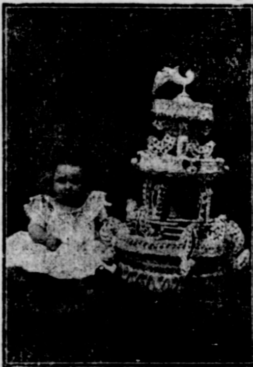
TWO SWEETS RODGERS BAKERY