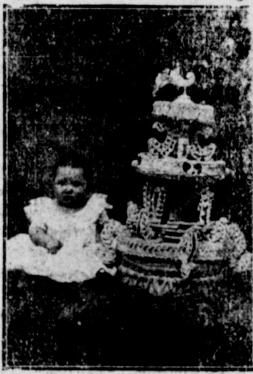
TWO SWEETS RODGERS BAKERY