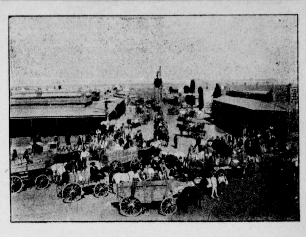
A FALL DAY IN MERKEL.