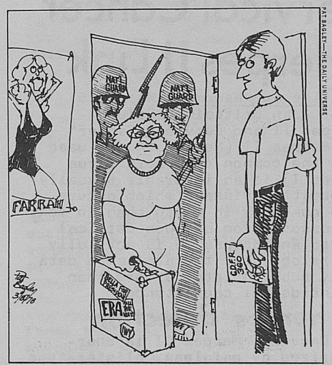
"Hey guys, our new roommate is here."