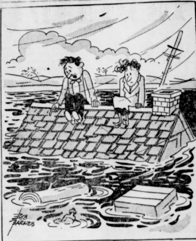
"I'm Glad We Came Up Here — I Hadn't Realized Before How Much We Needed A New Roof!"