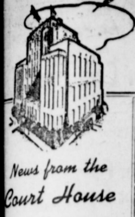
News from the Court House